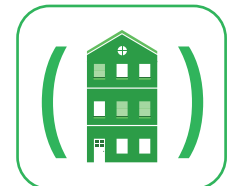
Air-sealing & insulation