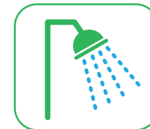
High efficiency shower heads

If your landlord is involved, you can get: