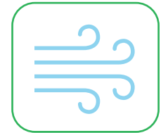
High efficiency cooling & heating equipment

If your landlord is involved, you can get: