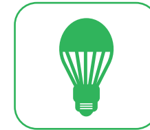
Advanced LED light bulbs

If your landlord is not involved, you can get: